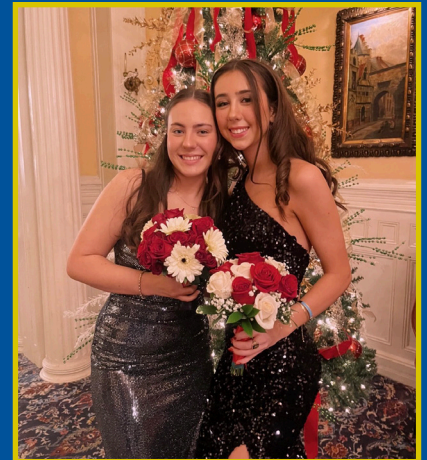
See REFLECTIONS ON THE HOLLY BALL, page 8

The night is filled with anticipation, as we prepare for this amazing event. All are so excited to wear our fancy outfits, creating our hair and makeup, and looking our best. In addition, we will take photos before the dance with our friends and dates. The photos help create lifelong memories, and all of us display how eager we are regarding this special dance. The time prior creates a happy and exciting atmosphere for the fun evening ahead.