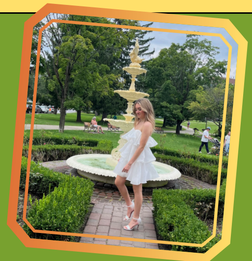
See FRAMING THE FUTURE, page 9

exactly what I was looking for, but I realized I would see it immediately. I remember shopping a few months prior and seeing the most beautiful white dress. I knew immediately that was what I was going to wear. I paired the dress with my favorite bow heels and added a bit of my personal style with my cowgirl boots. I decided to