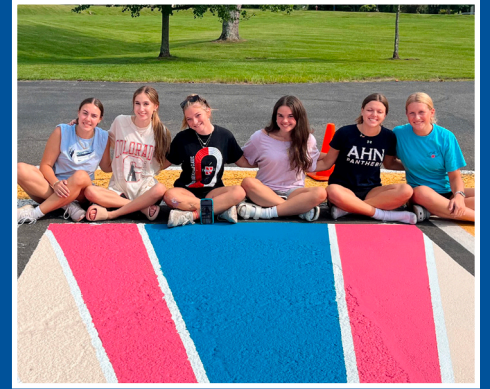
See SENIOR TRADITIONS page 8

Typically, each student designs and paints their assigned parking spot to highlight their personality or commemorate their time at school. This tradition marks a rite of passage and serves as a lasting memory of their high school experience,